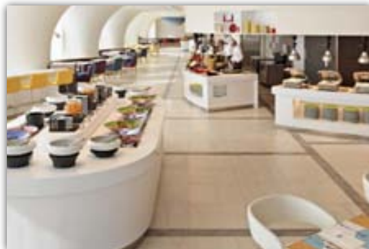
Restaurant in Hotel