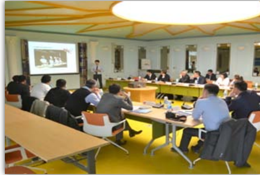
VIP room in Seoul Station